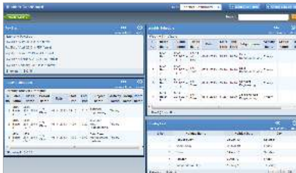
Faculty Self Service View